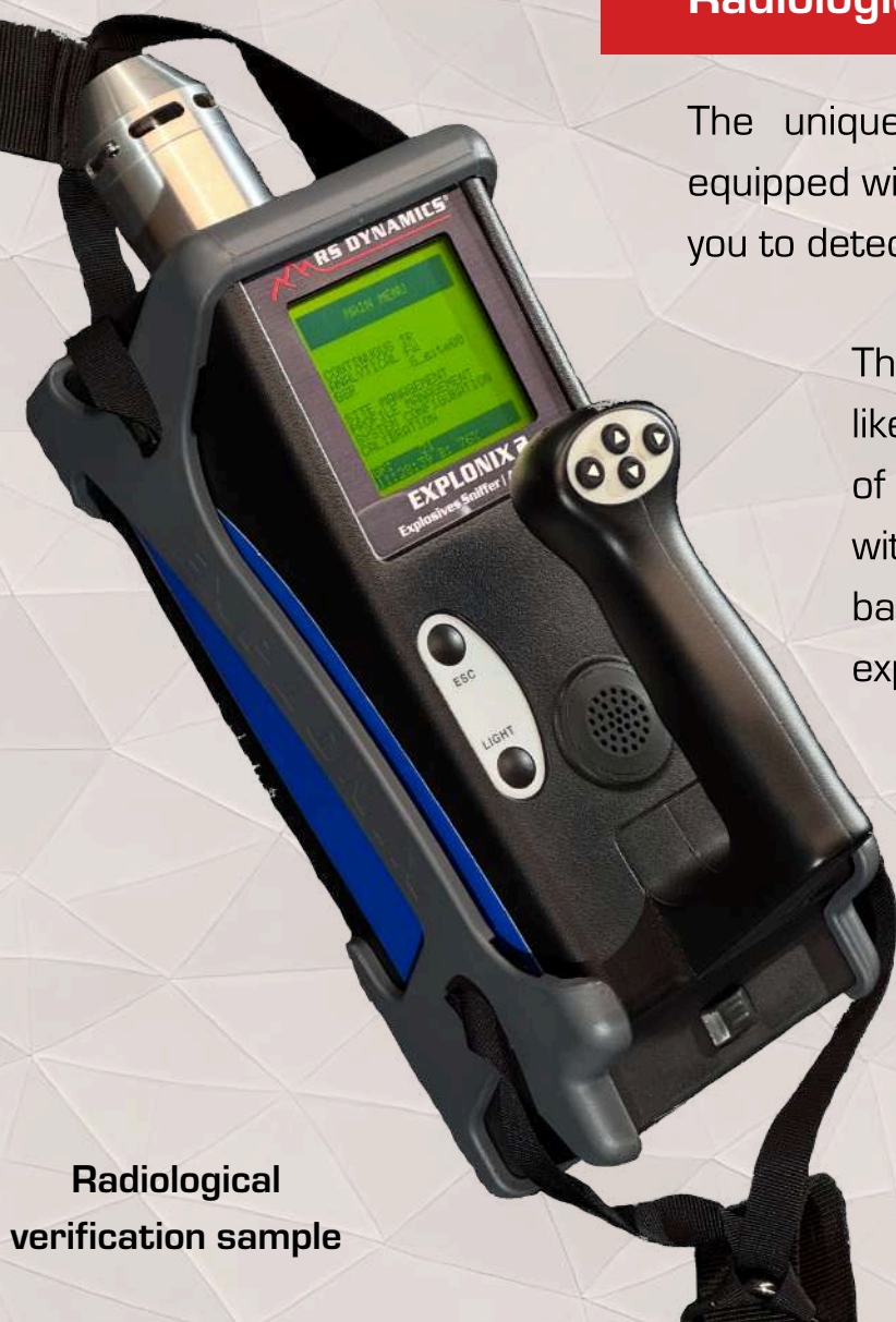
Radiological verification sample

The scintillation crystal, converting radioactivity in light, is placed in handle of the EXPLONIX 2. Simply put the testing sample close to the handle to verify functionality.